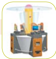
Customer ordering solution