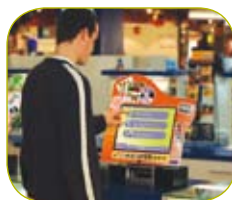
From a kiosk in store