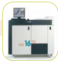
In-store production solution