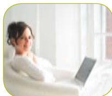
From a PC at home

You can also save the time of your customer and create photobooks directly from your minilab.