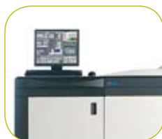
From a minilab