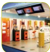
Concept store solution

Kis, a real global approach of the digital market !