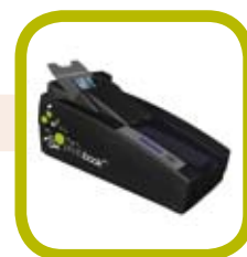
Post production added value solution