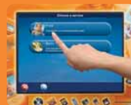
Photo prints or CD burning, express or 'à la carte' (selection, retouching and personalised photos).